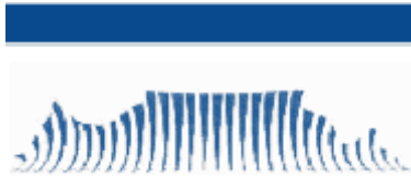
TABLE VIEW TOASTMASTERS CLUB

Welcome to the Table View Toastmasters club,